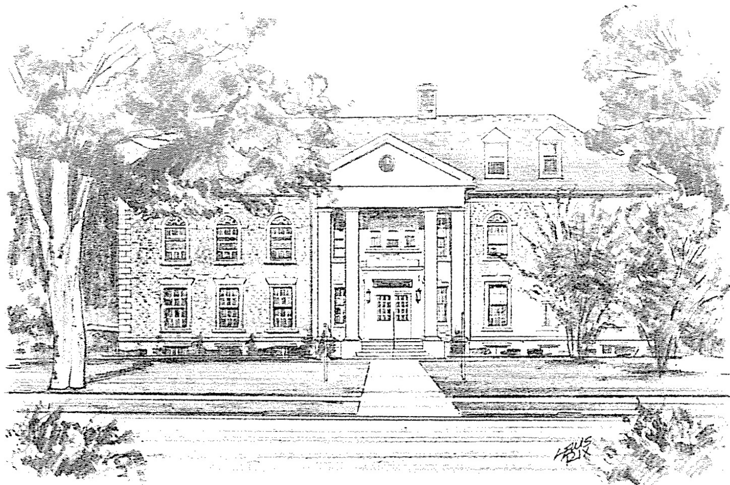
Wyoming County Court House Warsaw, New York